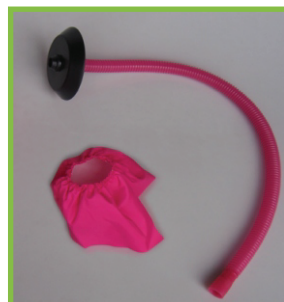
Inflator hose and protective cloth sleeve.