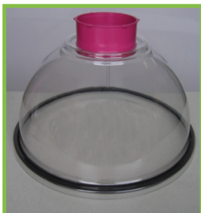
PUFF'N'STUFF™ lid with a collar that has six nubs.

Please check the contents of your PUFF'N'STUFF™ package. The package should include the following: